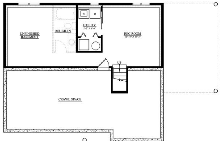
BASEMENT FLOOR PLAN 548 SQ. FT